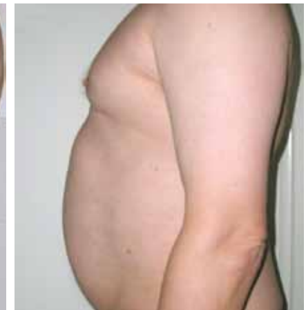
AFTER two Med Contour treatments

Med Contour uses a patented 1MHz dual-ultrasound generator to produce this effect, which is modulated between 20 and 60kHz. As a result, lipids and triglycerides are released from the cell and passed through the vascular and lymphatic system to eventually be excreted by the body.